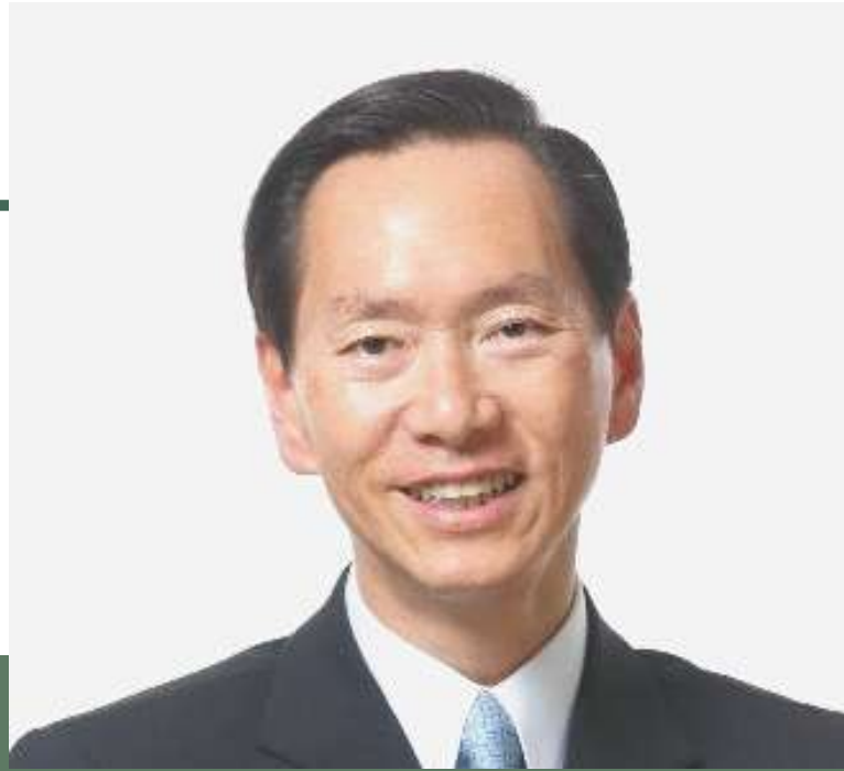
The Honourable BERNARD CHARNWUT CHAN

the Convenor of the Non-official Members of the Executive Council