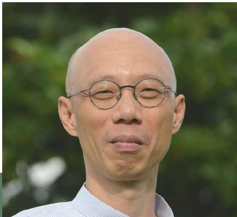
MR. WONG KAM-SING

Secretary for the Environment (環境 局局長 黃錦星先生)