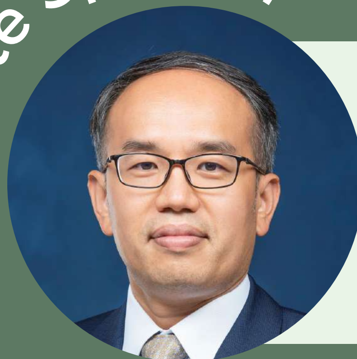
MR CHRISTOPHER HUI CHING-YU

Secretary for Financial Services and the Treasury