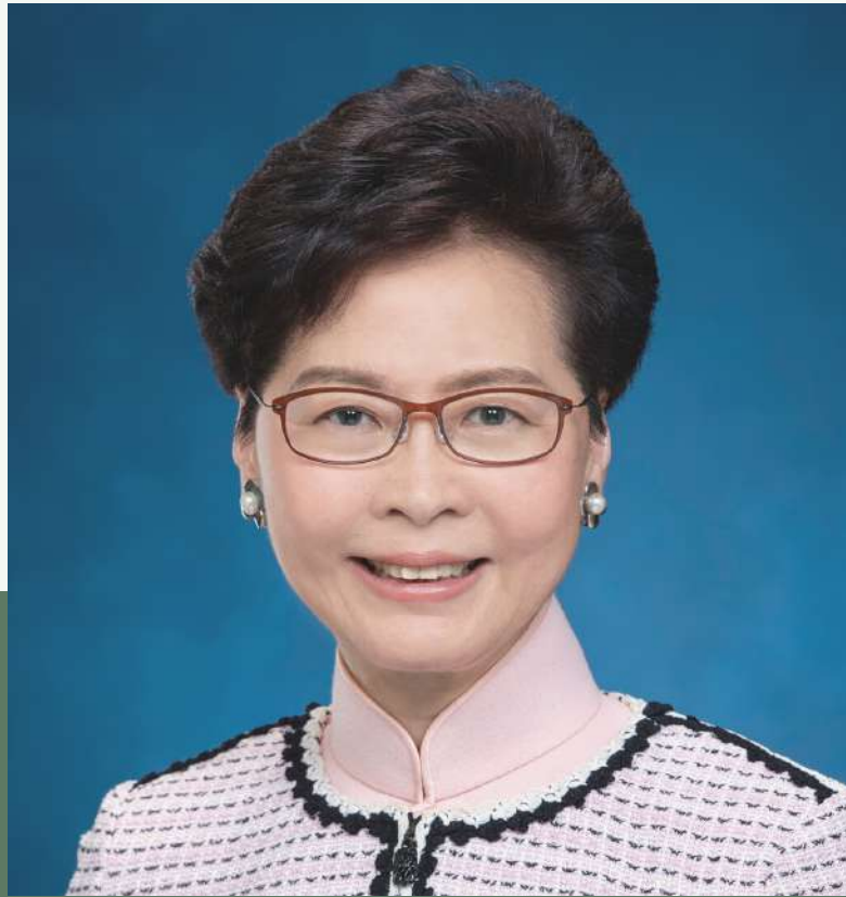
The Honourable MRS CARRIE LAM CHENG YUET-NGOR

The Chief Executive of the Hong Kong Special Administrative Region